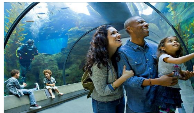
The California Science Center Foundation received a 501(c)(3) Bond

Small Business Finance Center – includes: