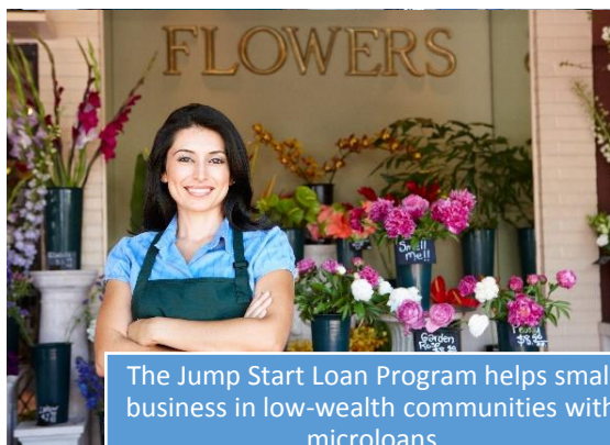
The Jump Start Loan Program helps small business in low-wealth communities with microloans

Small Business Finance Center – includes: