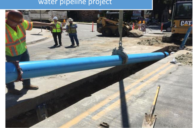
City of Big Bear Lake received funding for a water pipeline project